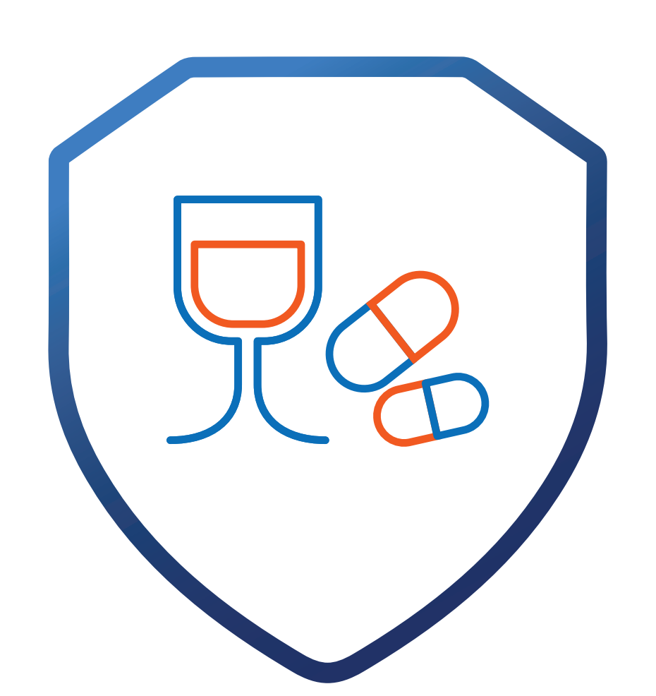
I never work or drive under the influence of alcohol or drugs.