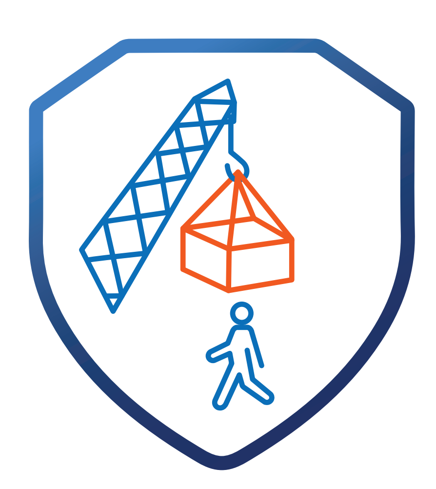
I never move under a suspended load, and I keep a safe distance from it.