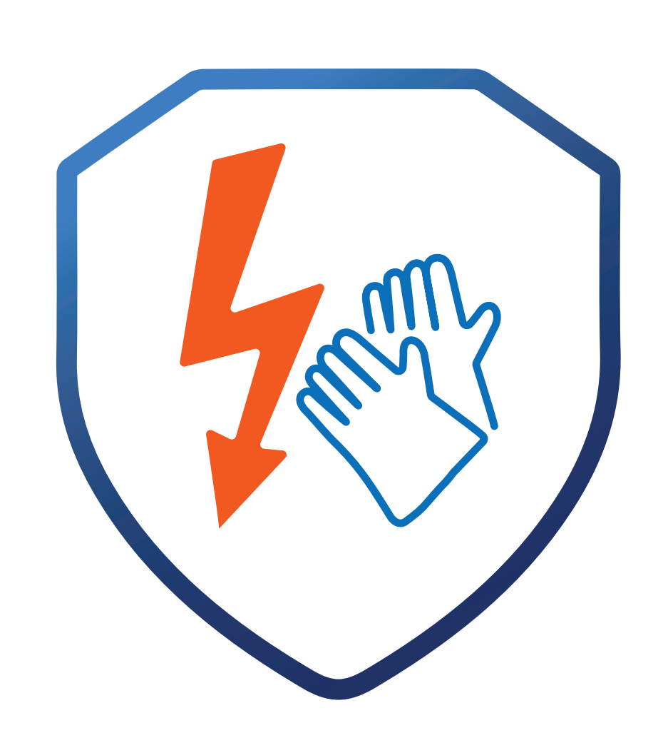
I always use the specified protective equipment when working with or near live equipment.