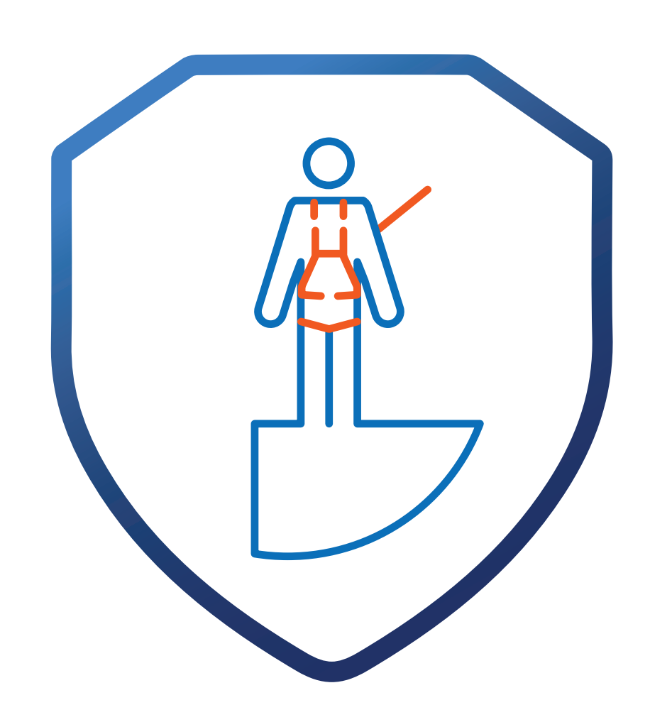
I always protect myself against falling from height and I protect others from falling objects.