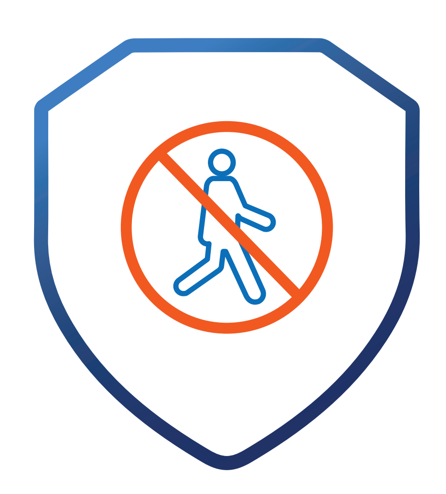
I never cross a barrier, including a radiography barrier, unless I'm authorised to do so.

We shall all comply with the 10 EDF Life-Saving Rules to protect us all from the hazards.